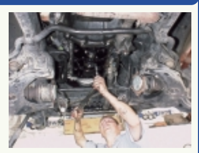
Includes: All bearings, gaskets, seals, thrusts, model specific parts (as applicable)