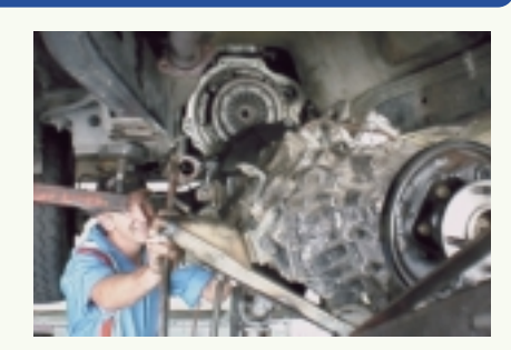
Includes: All bearings, gaskets, seals and model specific parts (as applicable)