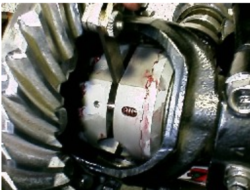
Check intercam spacing 145-165"