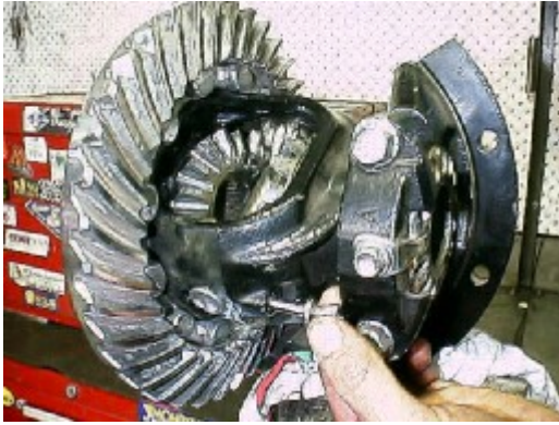
Remove cross shaft retaining bolt

Example is Landcruiser 40, 60, 75 Series