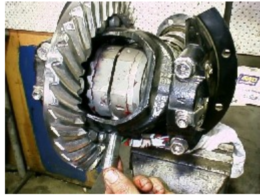
Slide cross shaft in