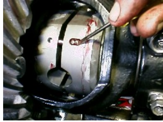
Push spring behind pins