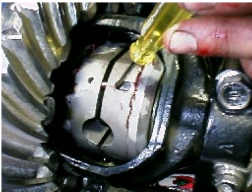
Slide Pins into mating half