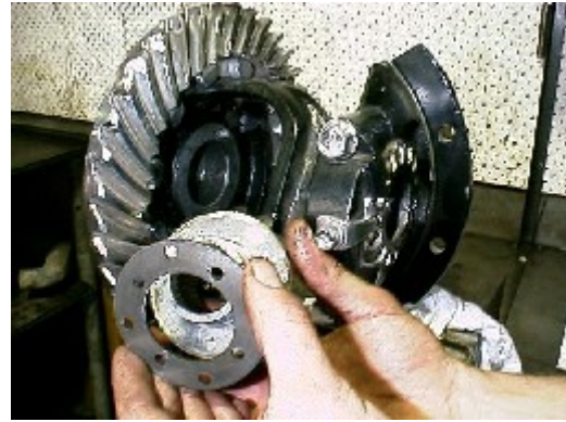
Remove gears & thrust washers