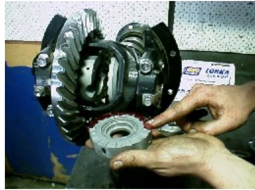
Fit spacers into cam gears and grease teeth