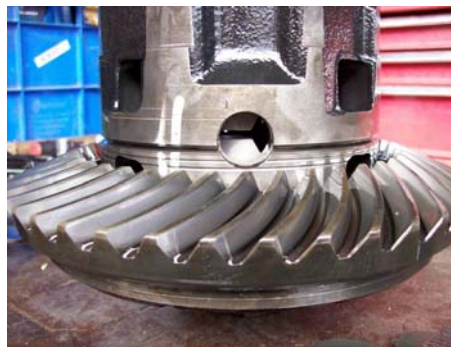
Use spider cavity to access Inter Cam gap