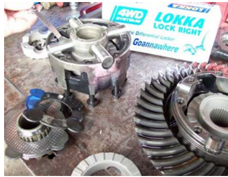
Measure spider to spacer clearance – both