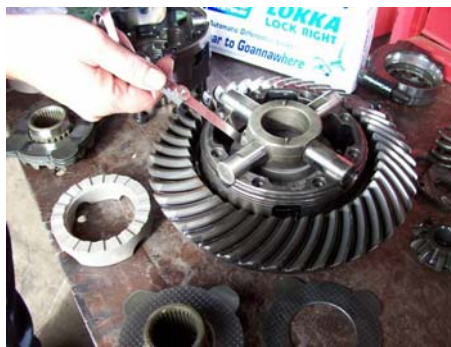
Seat axle gears and spacer rings into carriers