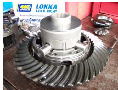
Stepped pin end fits into spring