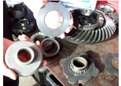
Use 1 shiny plate as thrust washer