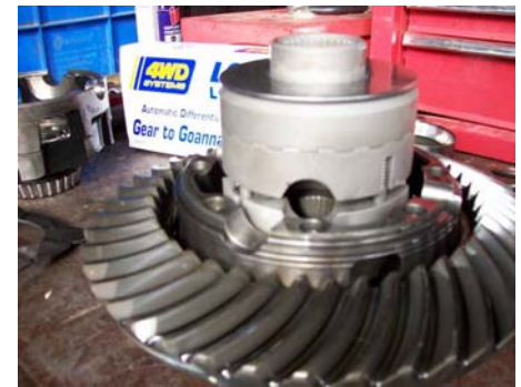
Assemble with no spider, align offset