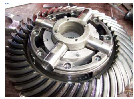
Assemble with spider assembly