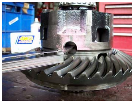
Measure Inter Cam gap