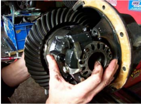
Mark & remove carrier bearing caps