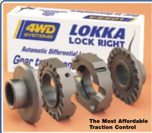
The Most Affordable Traction Control